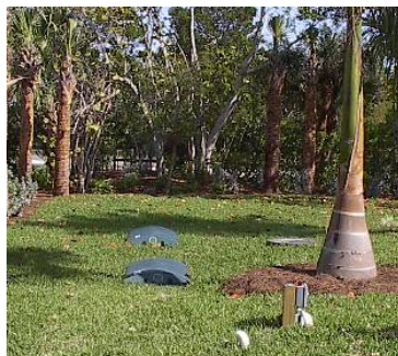
900 Gallon Per Day System

Extensive university research, independent third-party testing and real world experience have demonstrated that the Eco-Pure Peat Moss Biofilter will protect the most sensitive environments.